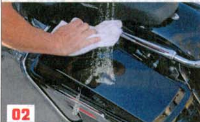
02 Before getting started, the lids needed to be washed with soap. It's a good idea to wash your hands too—you don't want greasy fingerprints preserved under the film forever.