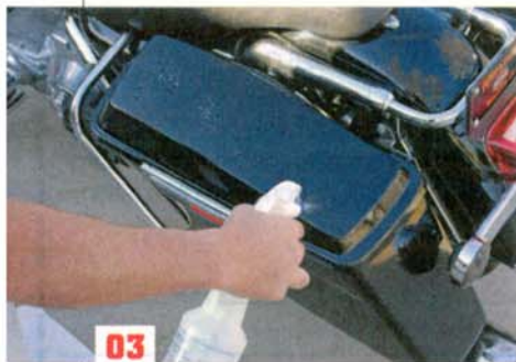
03 The MA Slip Solution was diluted in a spray bottle for easy application.