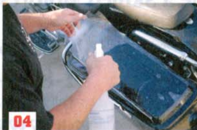
04 After a liberal dousing of both the lid and the film, the film was peeled away from the backing and laid on top of the bag. The solution helps the film slide around for easy positioning. It's important to keep it wet during the install.