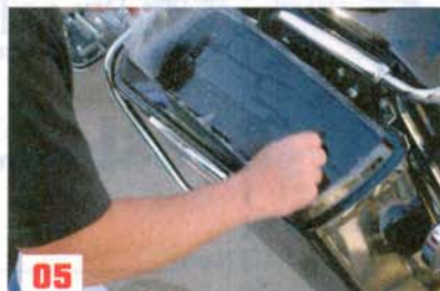
05 Once the film was positioned on the lid the squeegee was used to remove excess fluid and air bubbles from underneath the film. Wet is the key here to avoid scratching the film. Once the bubbles were removed, the edges were treated with the squeegee and followed by the MAtech towel to remove the remaining moisture. Then repeated for the other bag lid.