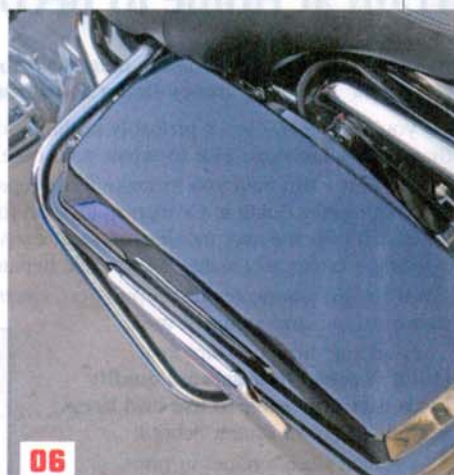
06 Here's a final shot of the saddlebag lid with the invisible MA applied on top. It looks factory fresh, covers existing scratches, and is protected for years to come.